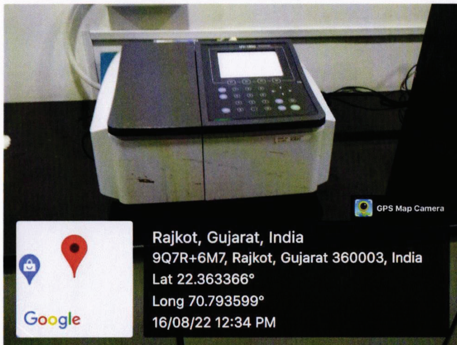
Spectrophotometer, SHIMADZU, UV-1800