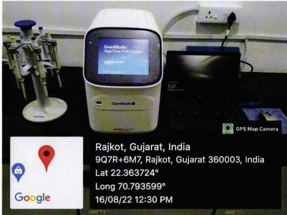
Real time PCR, Applied Biosystem, Quantstudio 5