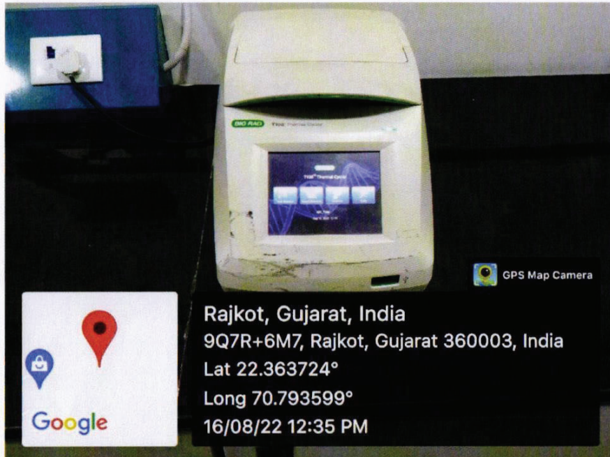
PCR, BioRad, T-100 Thermal Cycler